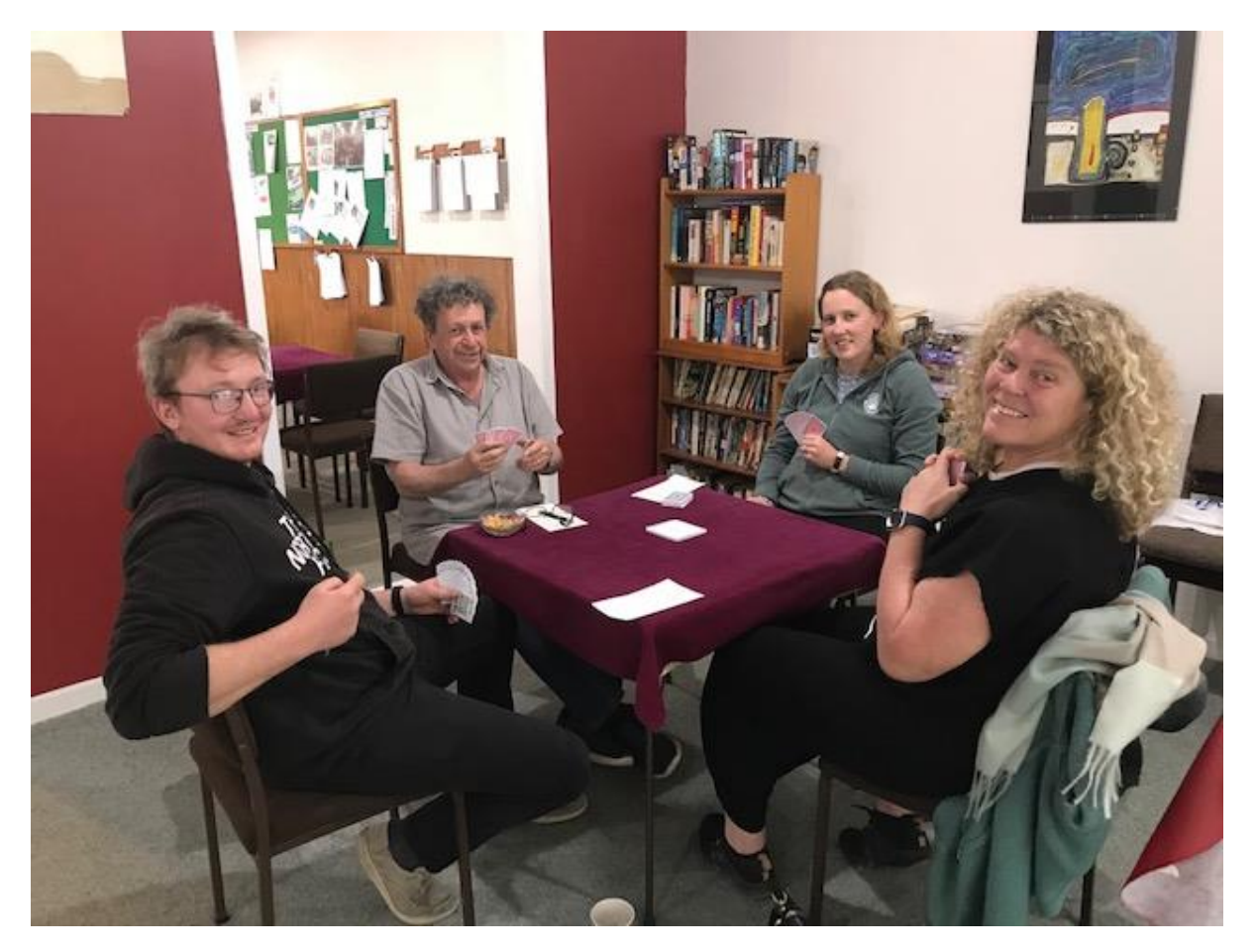
A brief photo pose in the midst of the Rubber final

For the first few boards, the match was quite even and Anna and I even had a small lead...but not for long! Deals like the following occurred. The cards were quite wild: